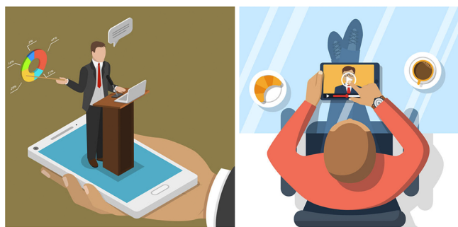
Figure 3. Online conferencing.

gatherings can take place online without compromising the quality of the scientific exchange (Figure 3). Some of the