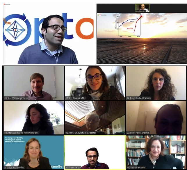
Figure 2. Impressions from the nanoGe Online Meetups and the ViPerCon. 22

There has been an effort from the energy research community in this direction. In particular, the nanoGe platform has organized a new series of online meetups that gathered the photovoltaics community, 2 along with the first virtual perovskite conference (ViPerCon) that took place in April 2020, 3 jointly bringing together more than 1200 attendees worldwide over several days of online seminars (Figure 2). This provided a new stage to meet and exchange